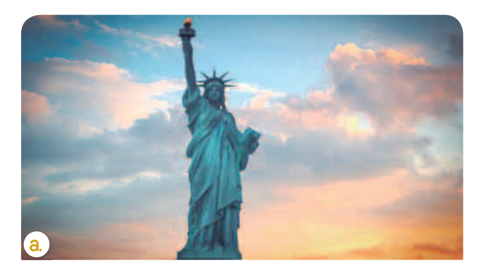
The Statue of Liberty is a/an

Look at the pictures and describe the objects in detail. Complete the sentences with adjectives.