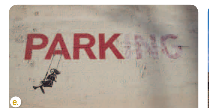
This is one of Banksy's

sculpture created by artists and volunteers.